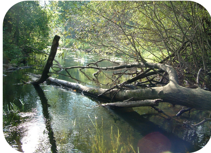
Honey Creek flows through a near even mix of forest, wetland, agriculture, and suburban neighborhoods.