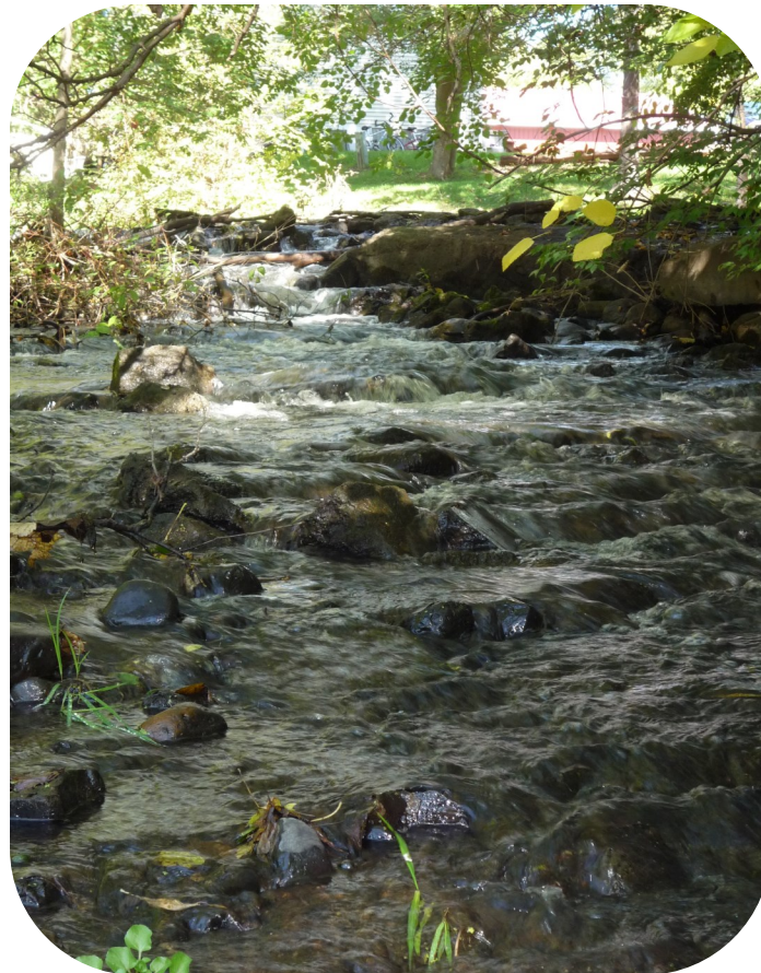
The “dam” at Mill Pond in Pinckney is now a steep slope made of concrete, logs, and rocks. It drops about 3 vertical feet over 45 horizontal feet.