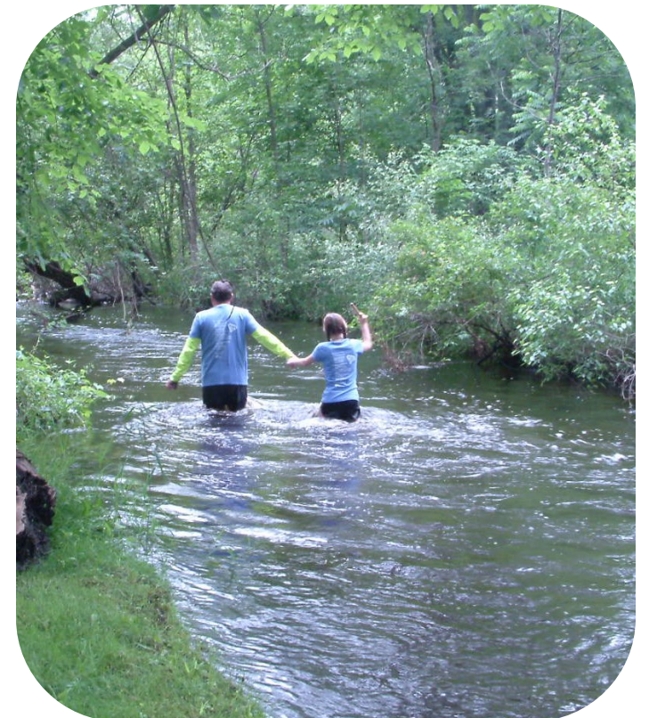
HRWC volunteers explore Honey Creek at Darwin Road. This picture was taken several days after a large storm and the water is about 6 inches higher than normal baseline conditions.

Conductivity is a measurement of the amount of ions (also known as salts) dissolved in water. Conductivity is a quick and easy measurement to make, and is useful as an indicator of potential problems. Conductivity levels in Honey Creek are normal and have been normal since monitoring began in 1996.