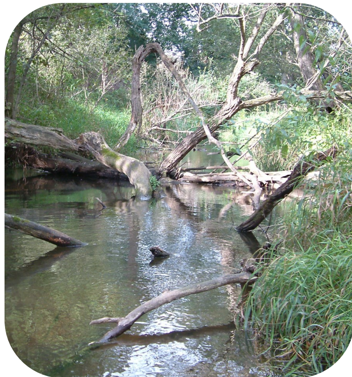
Like many small creeks, the amount of woody debris in Honey Creek is great for aquatic life but makes paddling the creek virtually impossible.