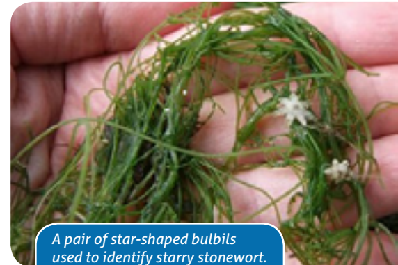
A pair of star-shaped bulbils used to identify starry stonewort.

Starry stonewort reproduces aggressively. Tiny fragments of the algae can generate entirely new mats of starry stonewort, and the fragments can be easily spread, whether stuck to an unwashed boat or on the underside of a duck's feather. Lastly, starry stonewort can be found at greater depths than most native aquatic plants. It has been recorded growing three meters high in nine