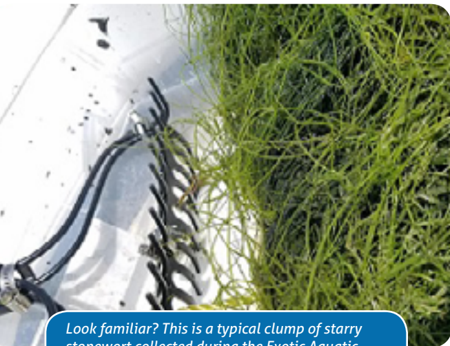
Look familiar? This is a typical clump of starry stonewort collected during the Exotic Aquatic Plant Watch on Woodruff Lake in Oakland County.

Both muskgrass and starry stonewort filter out nutrients from the water column and stabilize the sediment. However, because it grows at greater depths than muskgrass, starry stonewort can cover more area and fill more volume in the lake, potentially filtering out too many nutrients and choking the sediment.