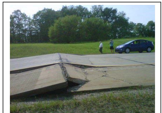
Pavement buckled due to extreme heat in Calhoun County, MI during the June, 2011 heat wave.

Strategies: Implementing improved storm water management, porous pavement, and heat-resistant surfaces would help reduce impacts on roadways.