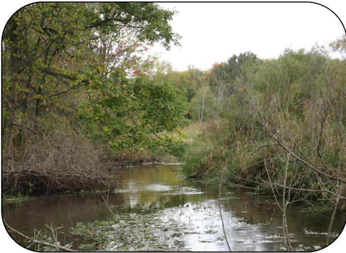
Horseshoe Creek, as it nears the Huron, flows through a mix of a forest, agriculture fields, and wetlands.