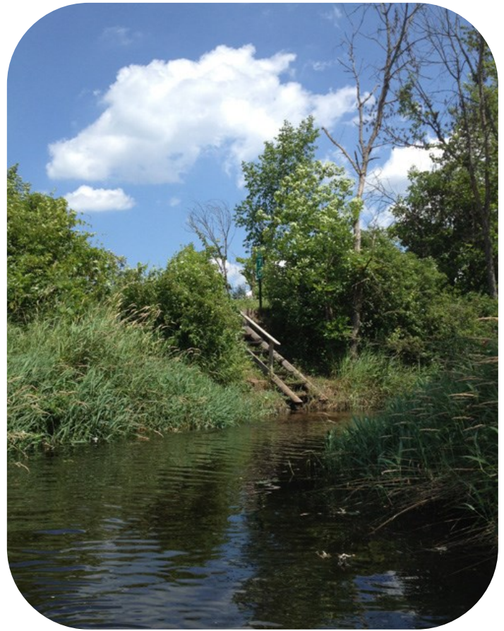
A rustic stairway connects the Lakelands Trail to Horseshoe Creek.