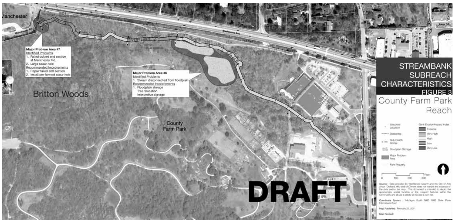
Aerial of the Mallets Creek Project at County Farm Park, along Washtenaw Avenue in Ann Arbor.