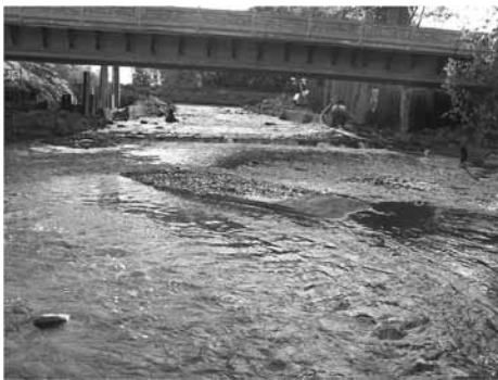
The Village of Dexter removed a dam in Mill Creek in 2008. Today, the free-flowing river is the centerpiece of a downtown revitalization project.

HRWC’s goals regarding dams are three-fold. First, HRWC desires to remove unwanted and environmentally-unfriendly dams from the Huron River and its tributaries. Second, for dams that remain in place on the river, HRWC wants them to be safe for the public through regular, proper maintenance. Third, HRWC wants to work with dam owners to improve the management of dams in order to minimize their impact on the river.