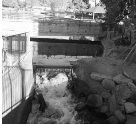
The Mill Pond Dam in Brighton creates a weedy impoundment on South Ore Creek.

In regards to HRWC’s first goal, there are many dams whose removal would benefit the river ecosystem. However, there are limited funds for dam removal, and deciding how to best use these funds is an important decision. HRWC has developed a prioritization tool to determine which dams are most economically and socially feasible to remove and would also result