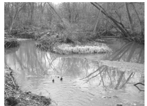
Malletts Creek prior to restoration efforts. Note the wide channel, high sediment content, and bank erosion.

TMDL sets goals for reducing pollution, sediments, and runoff in order to improve waterway health. The DEQ determined that stream bank erosion, sedimentation, total suspended solids and flashy water flow in Malletts were causing poor fish and macroinvertebrate communities. They also identified Malletts as a major contributor of phosphorus and E.coli to the Huron River. Over 1,000 tons of sediment each year was moving downstream to the Huron River from Malletts Creek and its tributaries.