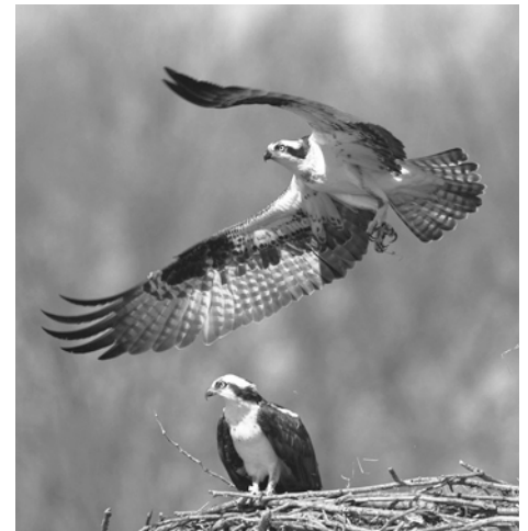
The return of the osprey to Michigan is an indication of improved water quality.

The goal of the osprey relocation project is to re-establish a breeding population of osprey in southern Michigan. The project is a joint effort between Huron-Clinton