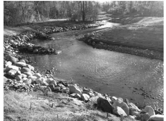
Malletts Creek at the completion of construction. Note the boulders and vegetation for bank stabilization, including the toe formations added on the outer bank to reduce undercutting and erosion.

The studies also found that while Malletts Creek’s banks were still eroding greatly, the stream bed was near a stable