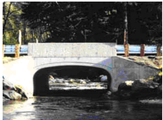
Figure 2. After: span bridge with natural bottom.