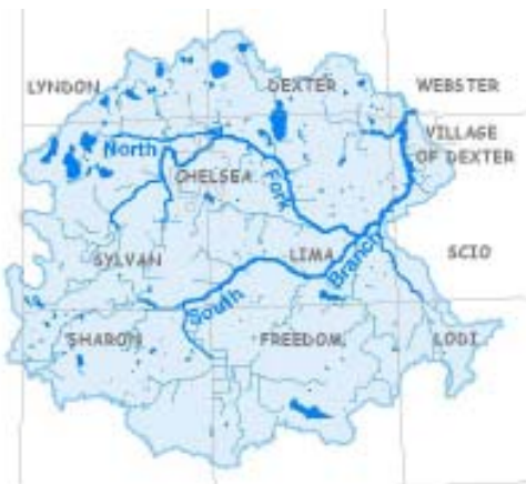
The Mill Creek Subwatershed.—map: HRWC