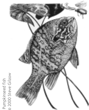
Pumpkinseed fish