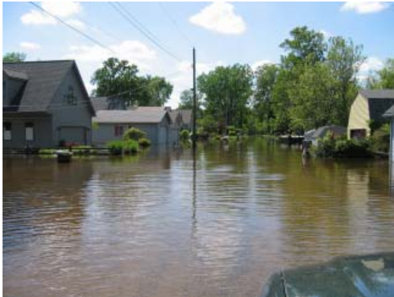
Flooding of residential property adjacent to Ore Lake in Hamburg Township.

As the South Ore creekshed and portions of the Huron River Watershed upstream of South Ore Lake become more urbanized, pressure to build in the floodplain increases, as does subsequent runoff potential from a more developed landscape. Both of these factors portend intensified flooding problems. As devastating as the flooding was around Ore Lake, USGS data indicates that it probably was not a once-in-a-lifetime