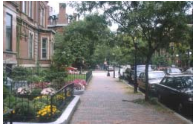
Many actions being considered will encourage the creation of walkable, livable, “cool” cities.

1 Sources: Gongwer News Service and Michigan.gov and Michiganlegislature.org websites.