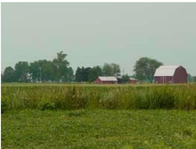
The state legislature is considering an "agricultural security areas" bill that would help preserve farmland.