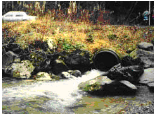
Figure 1. Before: undersized culvert.

One barrier in the Huron River Watershed is located underneath the Geddes Road Bridge on Fleming Creek in Washtenaw County. The old Parker Mill Dam washed out in a flood in the early 1980s, but the concrete spillway remained. The Michigan DNR sought to remove the spillway, but ultimately decided against it under the notion that the shallow, fast water prevented carp, other nonnative fish, and zebra mussels from moving upstream into the middle and upper reaches of this healthy coolwater stream. However, Dr. Smith deems that this velocity barrier also most likely prevents native warmwater fish and mussels from accessing those upper reaches.