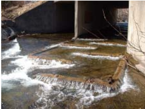
To aid fish migration, volunteers have installed these wooden deflectors on the right side of the bridge.