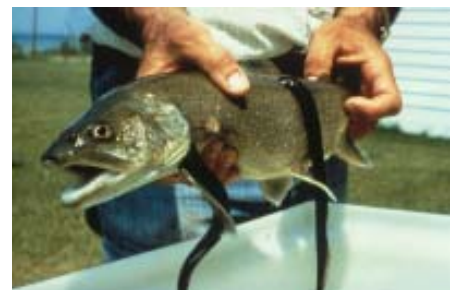
Sea Lamprey ( Petromyzon marinus ) on a Lake Trout.

How have we subdivided our rivers and streams? Dams, bridges and culverts can create obstacles in various ways. Dams without fish ladders physically sever a river. Bridges with smoothed concrete bottoms designed to protect abutments from