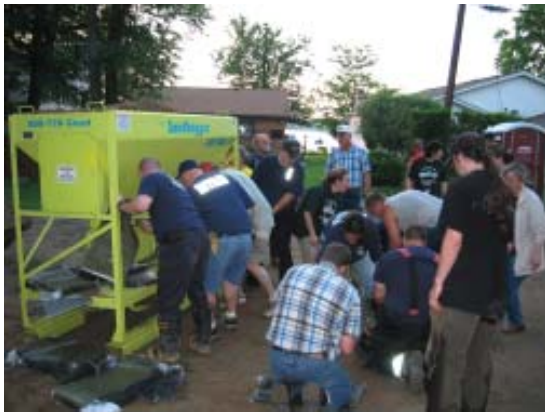
The Livingston County Drain Office's recently purchased sandbagging machine was put to the test during spring flooding around Ore Lake.

Following the torrential May rains that saturated much of southern Michigan, one might have expected to see nature's