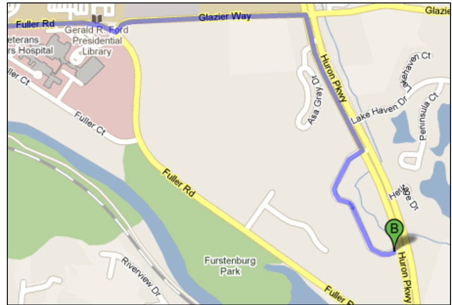
Close-up of Destination