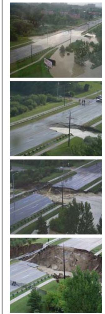
Severe erosion in Toronto, 2005.