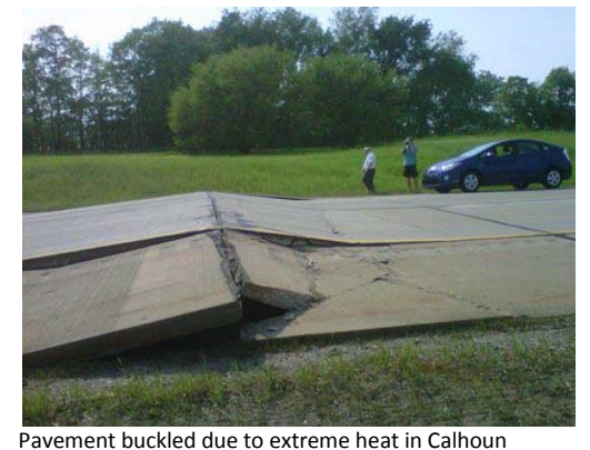
County, MI during the June, 2011 heat wave.