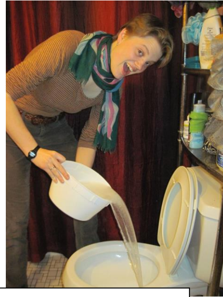
Look how much water that saved!