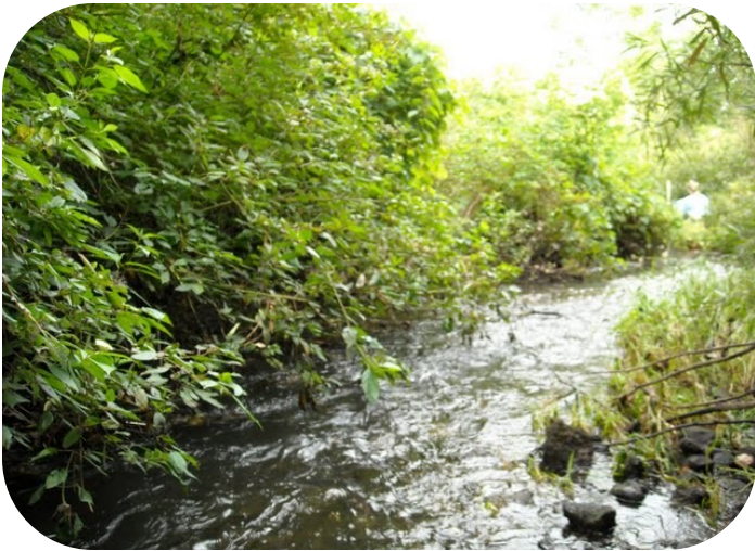
Trees and shrubs cover the banks of Norton Creek in mid-August.