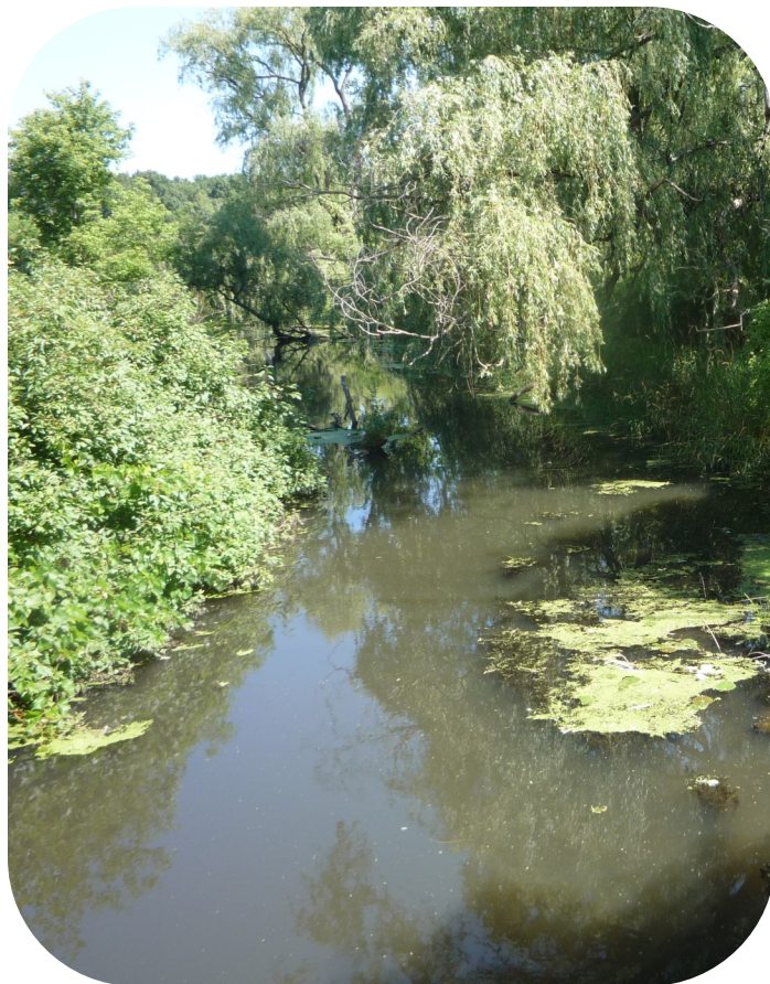
Norton Creek, as it approaches its mouth near the Huron River, becomes very slow and mucky.