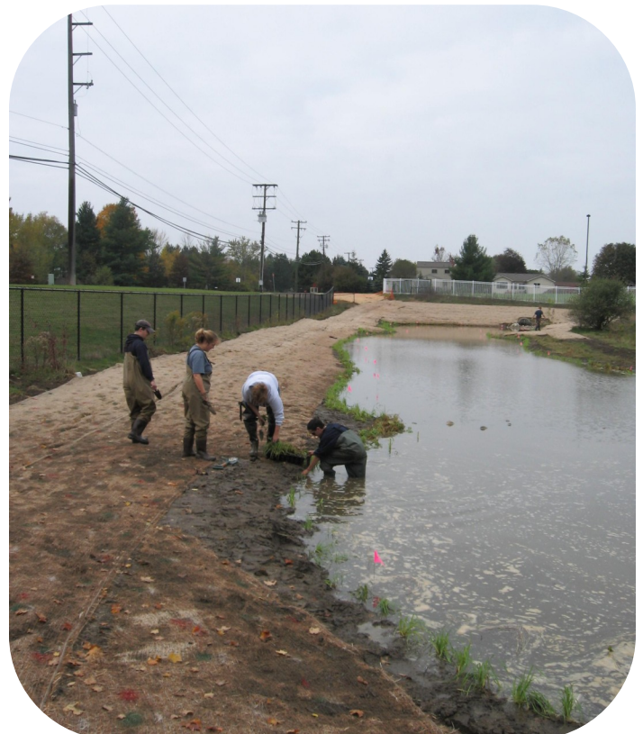
HRWC staff and volunteers install native wetland plants at the Sarah Banks Middle School in the Norton creekshed.

Conductivity is a measurement of the amount of ions (also known as salts) dissolved in water. Conductivity is a quick and easy measurement to make, and is useful as an indicator of potential problems, since conductivity is highly correlated with total dissolved solids (TDS). Conductivity levels in Norton Creek are very high and have been high since monitoring began in 2001. The DEQ declared Norton Creek to be impaired for TDS and will