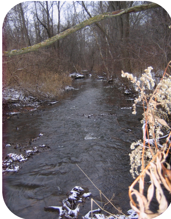
Many areas of Davis Creek run through beautiful, riparian forests.

• Nearly all of the existing natural areas in the creekshed are under private ownership and designated for some kind of development. If the creekshed loses these wetlands and forests, (it will lose the ecosystem services they currently provide) or (the creek will suffer further impacts from non-point source pollution).