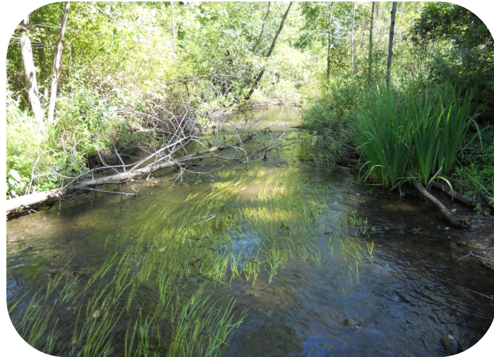
In stream plants and woody debris offer plenty of habitat variety at this site on Doane Road.