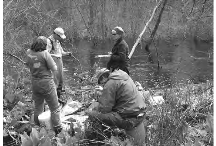
Spring is a great time to watch the creek flow - this team is sampling a quiet location on Davis Creek.

Some types of bugs are also very useful in checking on the water quality of a stream - that is, whether or not the