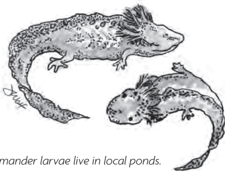
Salamander larvae live in local ponds. illustration: J. Wolf

Salamanders are important to the watershed’s natural areas not only for their aesthetic and educational value, but also for the ecological role they play. They contribute greatly to the forest and wetland food web, due to their numbers and their dual roles as both prey and predator as tadpoles and adults. In fact, tadpoles are top predators in vernal pools, hunting aquatic animals like insect larvae, copepods, fairy shrimp, and even other amphibian larvae. Especially beneficial to humans, the red-spotted newt eats copious amounts of mosquito larvae.