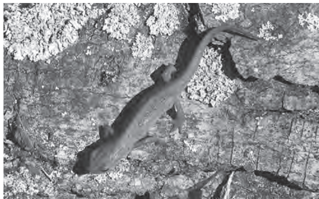
The red spotted newt transforms from tadpole, to a terrestrial eft (pictured here), then back to an pond-dwelling adult.