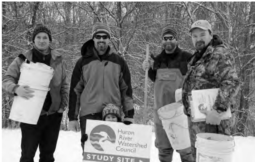
We need you to help us study water quality.

HRWC is expanding monitoring this season to lower Huron sites in eastern Washtenaw and western Wayne counties, as well as sites in the Ecorse Creek and Combined Downriver watersheds. This expansion builds on the success of the Water Quality Monitoring Program, which has generated highly useful water chemistry data for streams in the middle Huron and Chain of Lakes watersheds.