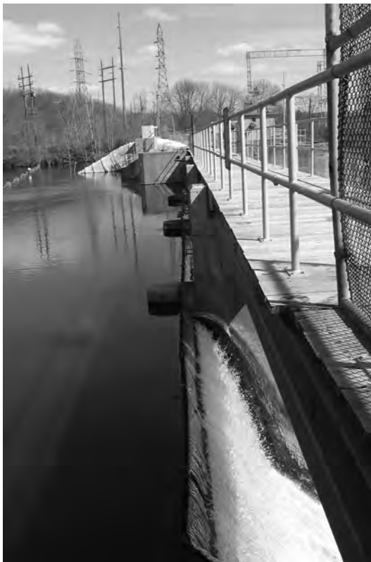
The Huron River has nearly 100 known dams.