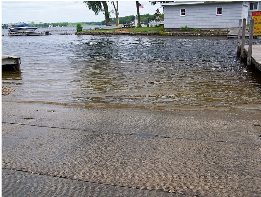
MDNR Launch at Portage Lake.

This hard surface launch is geared more towards motor-boats, but you can launch a canoe here. The public access ramp is located on a short channel with a moderate current. Strong paddling may be required to clear the channel (about 100 feet) into the lake.