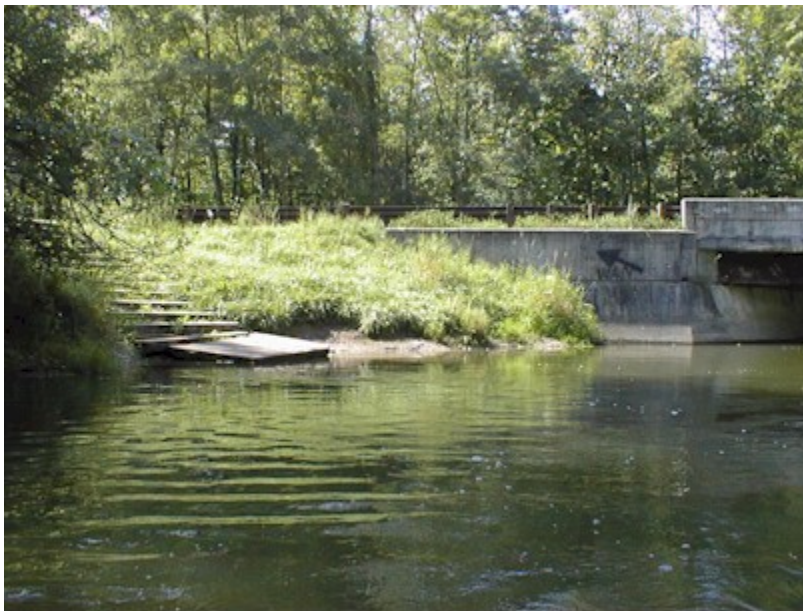
This is the landing for Heavner-supported trips concluding at Placeway Picnic Area.

Debris clearing in this part of the river is shared by the Island Lake State Recreation Area and a private livery. Contact Heavner Canoe and Kayak Rental if you are interested in renting boats for this trip.