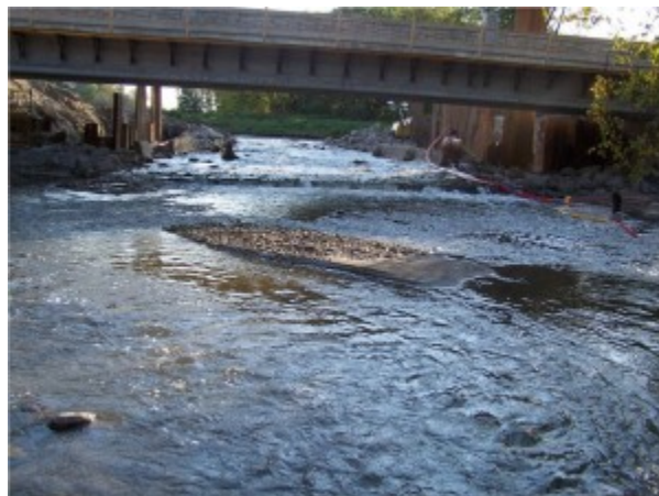
Mill Creek flows freely after dam removal in July 2008

[At mile 41, just upstream of Dexter, Mill Creek tributary enters the Huron River. In July 2008 Mill Creek Dam was removed, restoring a more natural flow regime.]