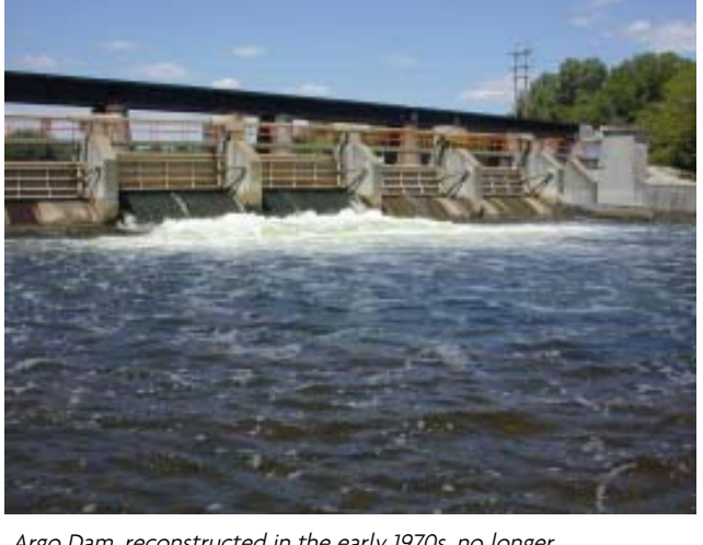
Argo Dam, reconstructed in the early 1970s, no longer provides flood control recreation on Argo Pond.

opinions about the parks, but only 44% and 35% of respondents expressed opinions about Argo Pond and Argo Dam, respectively. Of those who expressed opinions about the parks, 95% had favorable opinions. In contrast, just 49% of those with opinions about the dam expressed favorable opinions.