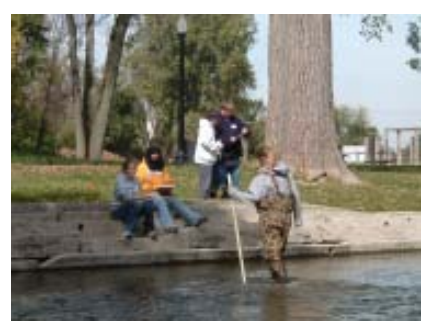
Flat Rock High School students measuring the river.