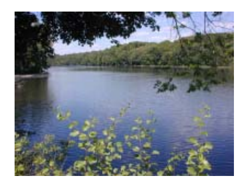
View of Argo Pond looking upstream from the Argo Dam.

In response to the entire set of perception questions regarding Argo Pond, Dam and parks, about 60% of respondents expressed