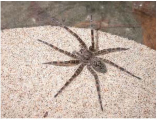
The dark fishing spider, Dolomedes tenebrosus, is the largest fishing spider found in the watershed.

Be sure to look for these amphibious arachnids during your first trip to your local