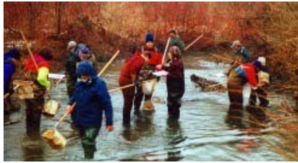
HRWC trains volunteers to collect benthic macroinvertebrates.