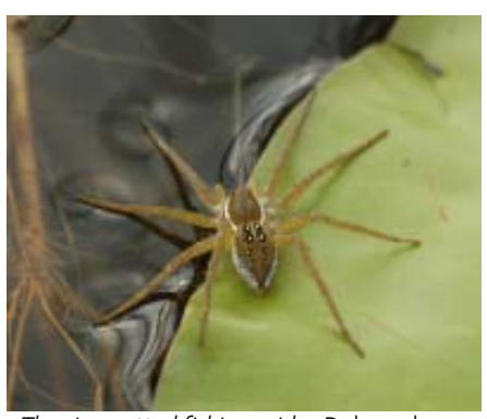
The six-spotted fishing spider, Dolomedes triton, sits in wait for aquatic prey.

Fishing spiders, like wolf spiders, are effective daytime predators that do not spin webs to catch prey. They rely on camouflage and excellent eyesight, waiting patiently for prey to pass their way and swiftly springing upon unsuspecting victims. However, fishing spiders do not limit themselves to land-based prey. As their name implies, these spiders also hunt