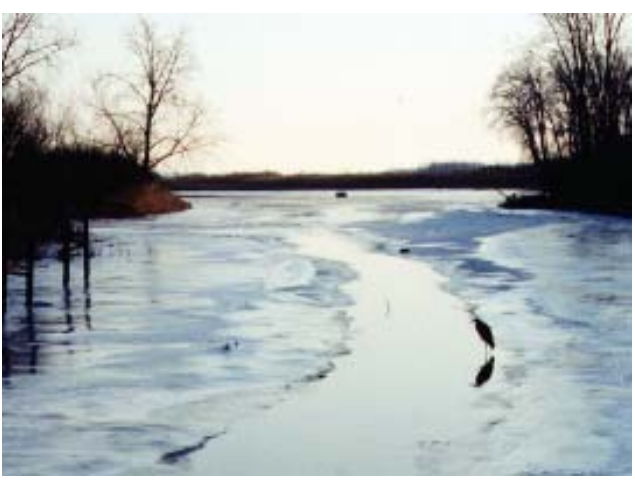
A great blue heron presides over the Huron River where it flows into Lake Erie. Water diversion does not affect just the Great Lakes, but all of the watersheds that support the Great Lakes system.

Farmers worry about a bureaucratic permitting program. Their complaints range from worries that the proposal's requirement to provide precise information about where their water wells are located could help terrorists, to fears that they could lose their rights to the water they use to grow their crops.