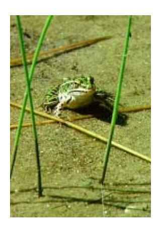
Natural areas provide a host of ecological services, including habitat for this Northern Leopard Frog.