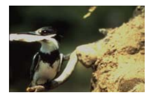
Kingfishers hunt and live along the river system.

HRWC staff spent 2 years digitizing the areas on a computer, using digital aerial photographs taken over Oakland, Livingston, Wayne, Washtenaw, and Monroe counties. We drew boundaries around areas on the photographs that appeared to be woodland, wetland, or open field, and ended up mapping nearly 1,700 sites, for a total of