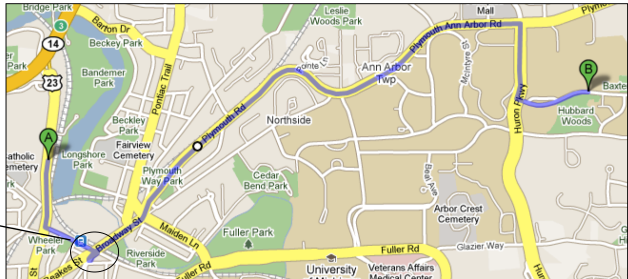
Overview of Trip