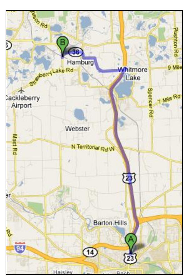
Overview of Trip